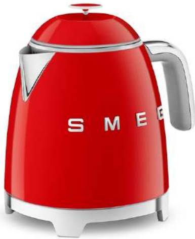
Smeg KLF05 Mini Kettle by deepdesign for Smeg SpA