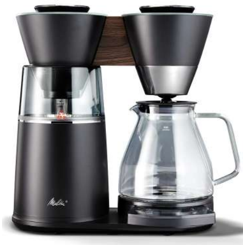
Melitta Vision Automatic Drip Coffee Maker by LDA for Wabilogic Ltd.