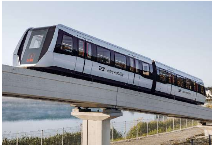
Urban Maglev Train - TSB by erfindergeist, ch GmbH for Max Bögl Bauservice GmbH & Co. KG