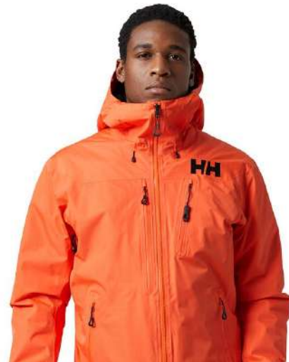
Odin 1 World Infinity Jacket by Helly Hansen