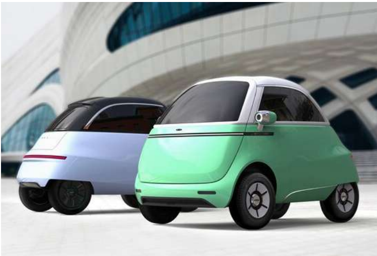
Microlino 2.0 Electric Car by Icona Design Group Turin for Micro Mobility Systems AG